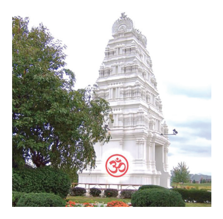
Hindu Temple of Dayton, Beavercreek, Ohio

BAPS Shri Swaminarayan Mandir Buddhist Meditation Temple Dayton Gurudwara Hindu Temple of Dayton (includes Om Shanthi Cultural Center) Jain Center of Cincinnati Dayton SRCM Heartfulness Meditation Center in Beavercreek