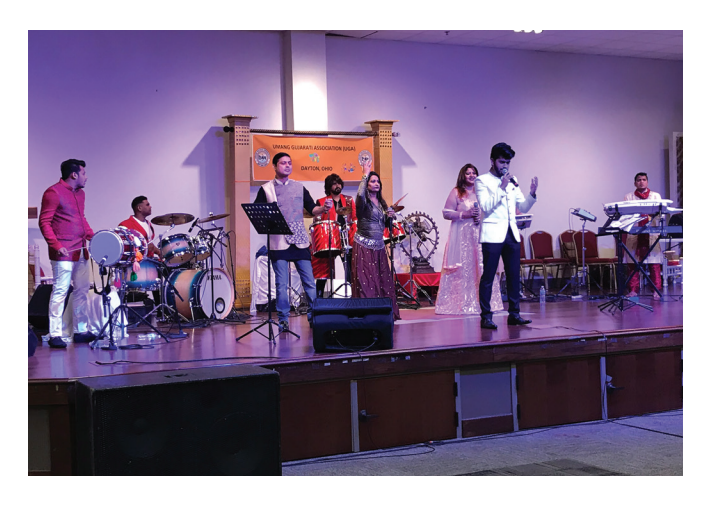
2019 IndiaFest Celebration