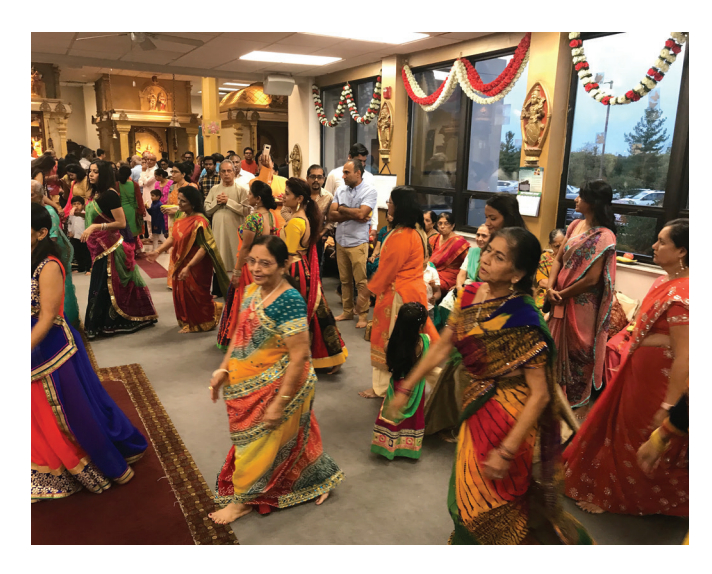
2019 IndiaFest Celebration