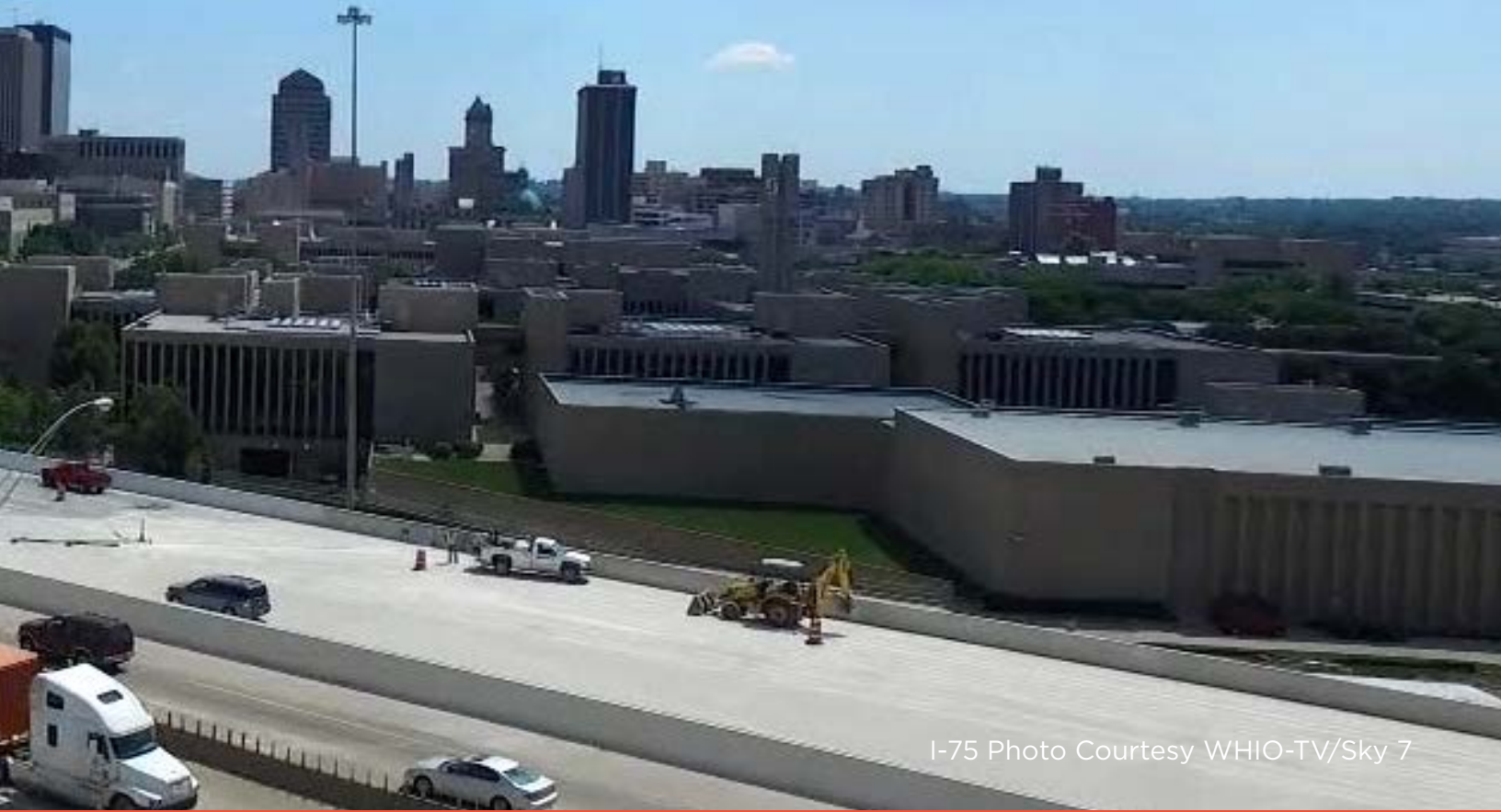
I-75 Photo Courtesy WHIO-TV/Sky 7

The improvements to “malfunction junction,” the formerly problematic four-and-a-half mile stretch of highway through the Region’s urban core, will do much to fix congestion issues, improve safety, and impart economic benefits to the Miami Valley Region.