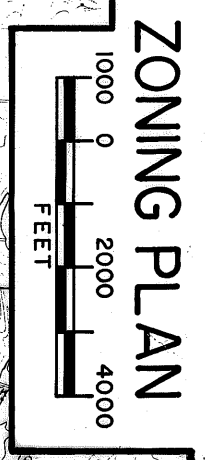
FIGURE B-2 HEIGHT LIMITATIONS