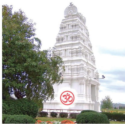
Hindu Temple of Dayton, Beavercreek, Ohio