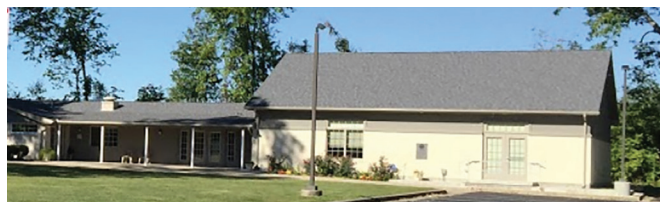
Heartfulness Meditation Center, Beavercreek, Ohio