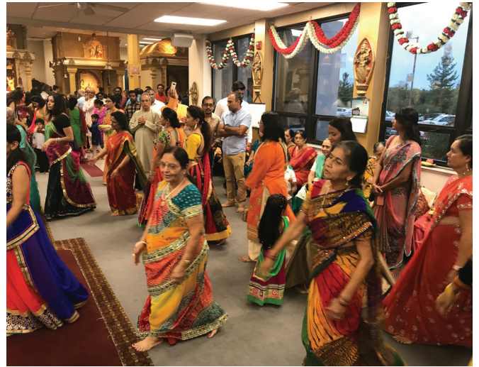
2019 IndiaFest Celebration