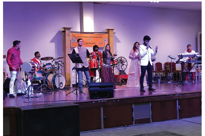
2019 IndiaFest Celebration